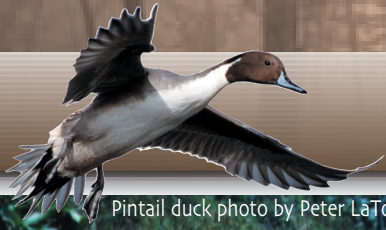
Pintail duck